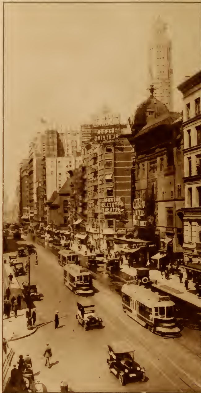
BROADWAY AT 38th STREET, In the background is the Bush Building, known as the castle in the air.